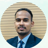
MR. PAWAN KALYAN K.